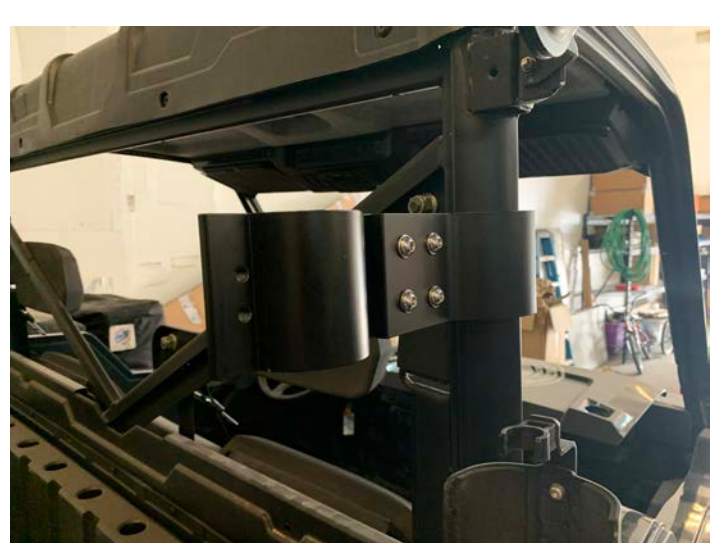
Note Inside bracket should have grove facing toward center of vehicle